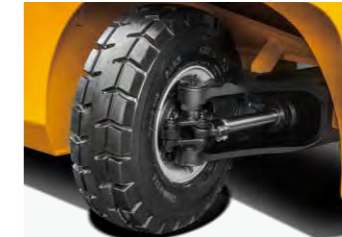
Steering bridge, tires